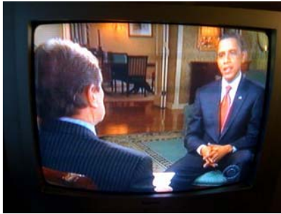
2 shot Set-Up